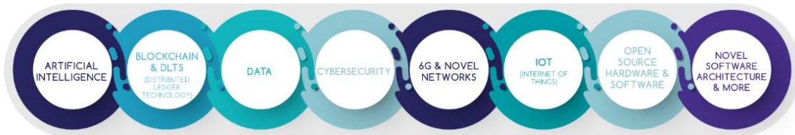
FIGURE 2. NGI SARGASSO TECHNOLOGY DOMAINS

Proposals submitted to the NGI Sargasso Open Call could use some of the following base technologies to address the challenges in the above areas of knowledge: Artificial Intelligence, Blockchain and DLTs (Distributed Ledger Technology), Data, Cybersecurity, 6G and novel networks, IoT (Internet of Things), Open-source hardware and software, novel software architectures, etc.