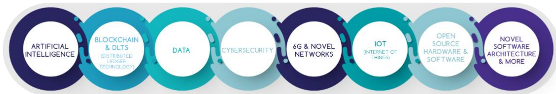
FIGURE 2. NGI SARGASSO TECHNOLOGY DOMAINS

Proposals submitted to the NGI Sargasso Open Call 4 could use some of the following base technologies to address the challenges in the above areas of knowledge: Artificial Intelligence, Blockchain and DLTs (Distributed Ledger Technology), Data, Cybersecurity, 6G and novel networks, IoT (Internet of Things), Open-source hardware and software, novel software architectures, etc.