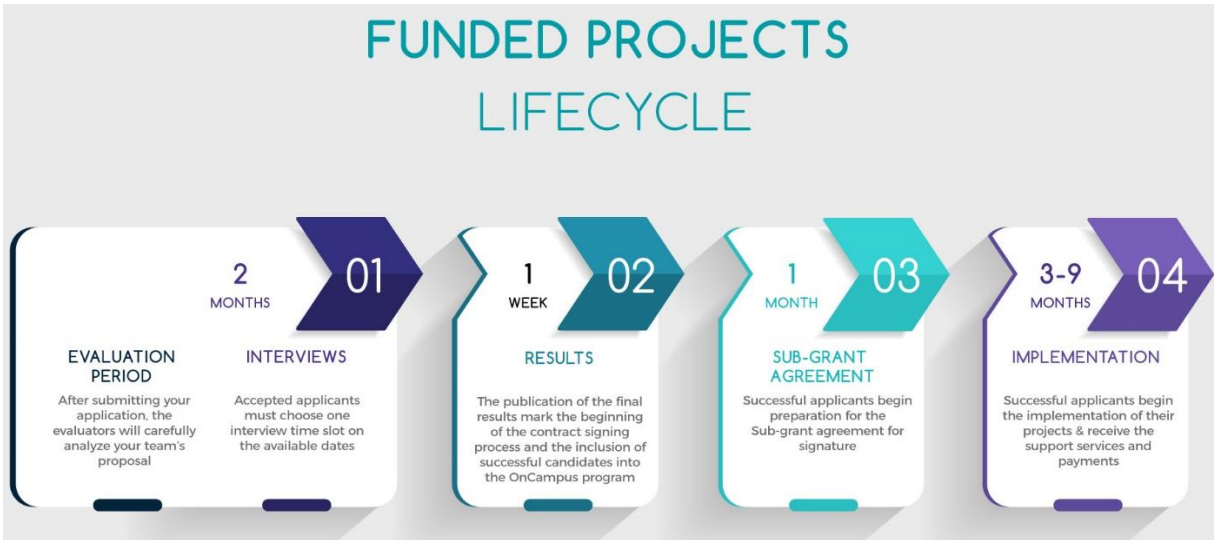
FIGURE 3. LIFECYCLE OF A FUNDED PROPOSAL