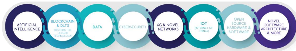
FIGURE 2. NGI SARGASSO TECHNOLOGY DOMAINS

Proposals submitted to the NGI Sargasso Open Call#3 could use some of the following base technologies to address the challenges in the above areas of knowledge: Artificial Intelligence, Blockchain and DLTs (Distributed Ledger Technology) , Data, Cybersecurity, 6G and novel networks, IoT (Internet of Things), Open-source hardware and software, novel software architectures, etc.